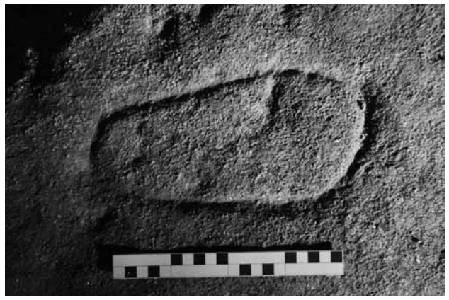
Fig. 7 - Engraved footprint located in the visitable area of Citânia de Briteiros (Daniela Cardoso)