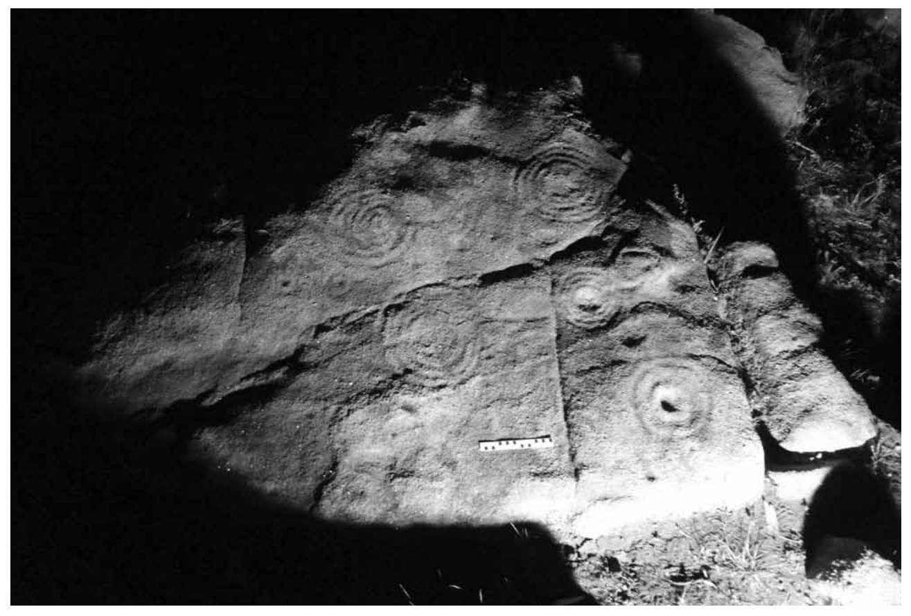
Fig. 9 - View general of the pannel 3 of Quinta do Paço located in the 2° wall of Citânia de Briteiros (George Nash)