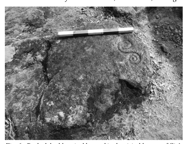
Fig. 6 - Pecked double spiral located in the visitable area of Citânia de Briteiros (Daniela Cardoso)