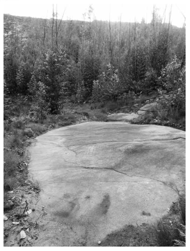
Fig. 10 - View general of the rock art pannel located in the site Donim 2 (Daniela Cardoso)