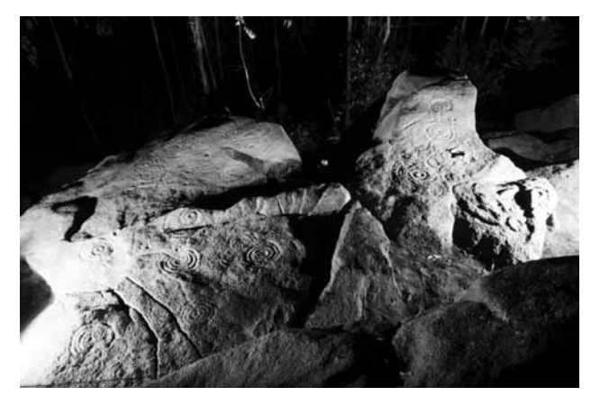
Fig. 8 - General view of the engraved pannels at Penedo dos Sinais located in the 3° wall of Citânia de Briteiros