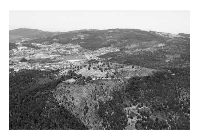
▲ Fig. 1 - St. Romão's Mount - general view

1933 Dispersos: colectânia de artigos publicados, desde 1876 a 1899, sobre Arqueologia, Etnologia, Mitologia, Epigrafia e Arte Pré-Histórica, Coimbra: Imprensa da Universidade