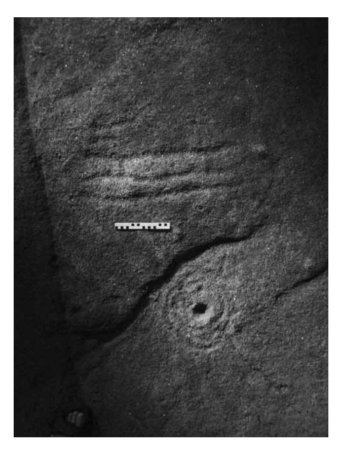
Fig. 11- Detail of the engravings in the site Donim 2 (George Nash)